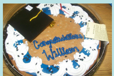
The "Graduation Cookie"